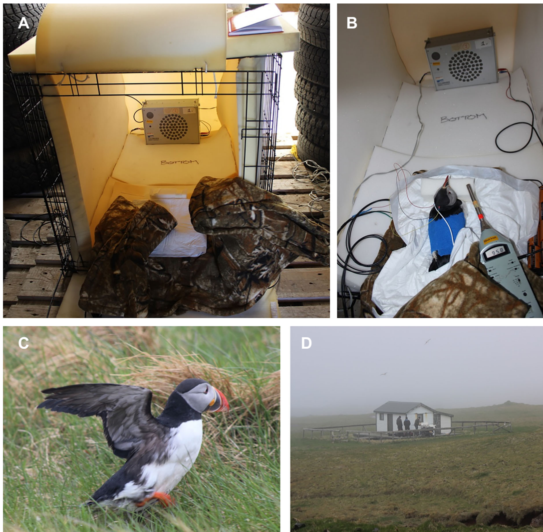
Fig. 1. Experimental setup and animal tested. (A) The semi-anechoic chamber lined with acoustically insulating foam. The speaker is at the far end, with heated blanket and bed-pad near the door. (B) The puffin during the AEP hearing test resting on a bed-pad and heated blanket. Electrodes are in place with the active electrode near the left ear. The sound level meter is to the right of the bird's head. (C) The puffin after release. (D) The location of the murre hearing test, Langanes peninsula, Iceland. The cabin offered a windbreak and is within 200 m of the rookery cliffs.

2005; Crowell et al., 2015; Henry and Lucas, 2010; Lohr et al., 2013; Maxwell et al., 2016). However, for the field study, the AEP equipment was outfitted in a rugged case. Examinations started with a broadband pulse consisting of two cycles of an 8 kHz tone pip; the resulting signal was relatively broadband with -10 dB energy from 4–12 kHz (see Fig. S1 for spectra) due to the short duration (0.25 ms) and rapid onset set of the signal. The auditory frequency range was then examined using tone pips of the following frequencies: 0.125, 0.25, 0.5, 1, 2, 3, 4 and 6 kHz. The tones were 20 ms in duration except for the 0.25 and 0.5 kHz tones, which were 40 ms in duration. All signals were digitally synthesized with a customized LabVIEW (National Instruments, Austin, TX, USA) data acquisition program and a National Instruments PCMCIA-6062E data acquisition card implemented in a semi-ruggedized Panasonic Toughbook laptop computer. Each test signal was created using a 256 kHz sample rate and presented at a rate of 10\text{ s}^{-1} . Tone pips were ramped up to limit spectral spreading using a sine envelope, thus the maximum amplitude was found at the middle two waves, \sim 10 or 20 ms, depending on the signal duration. Modulation of the brief tone created some minor sidebands (see Fig. S1), but